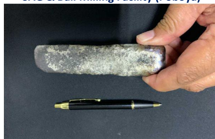
Dore Bullion From First Trial Production