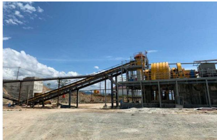
Ore Stock Pile Reclaiming System (Poboja)

As previously disclosed, BRMS plans to produce around 100,000 tons of ores in year 2020 and 180,000 tons of ores in 2021. The produced Dore Bullions will be sent to the Logam Mulia smelting facility in Jakarta to be processed into Gold Bars in February 2020.