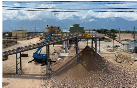
SAG & Ball Milling Facility (Poboja)